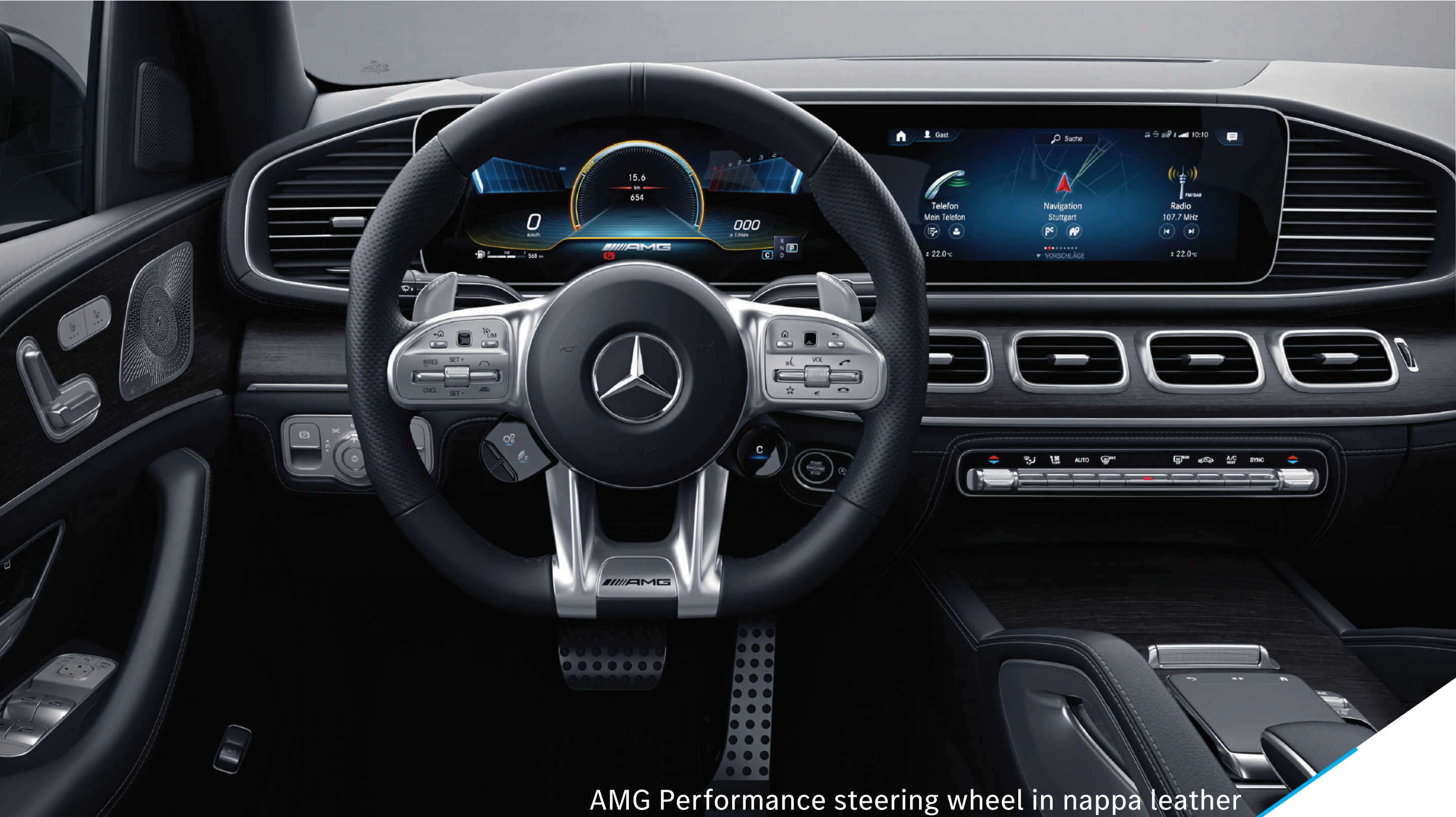
AMG Performance steering wheel in nappa leather