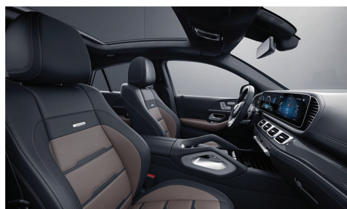
AMG nappa leather truffle brown / black