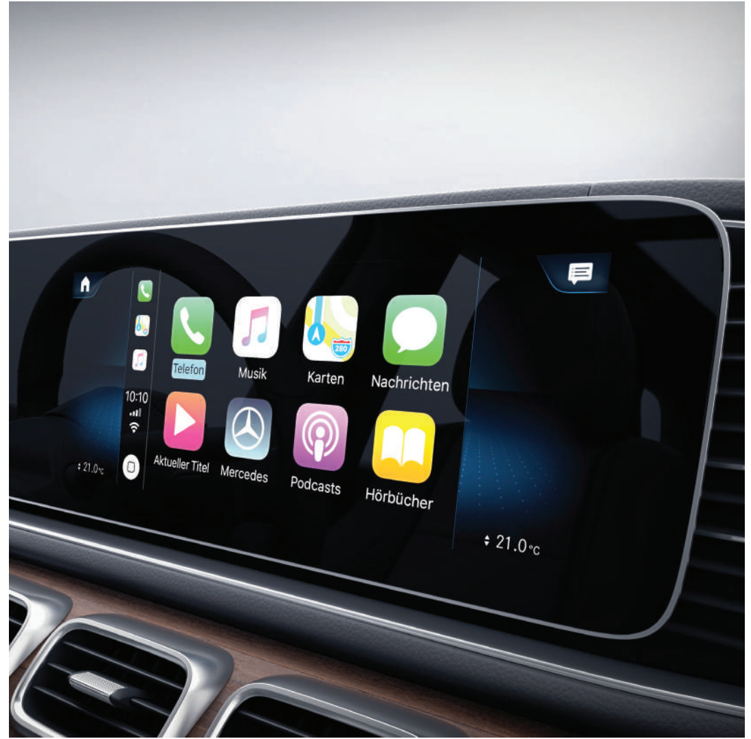
Android Auto™ & Apple CarPlay™