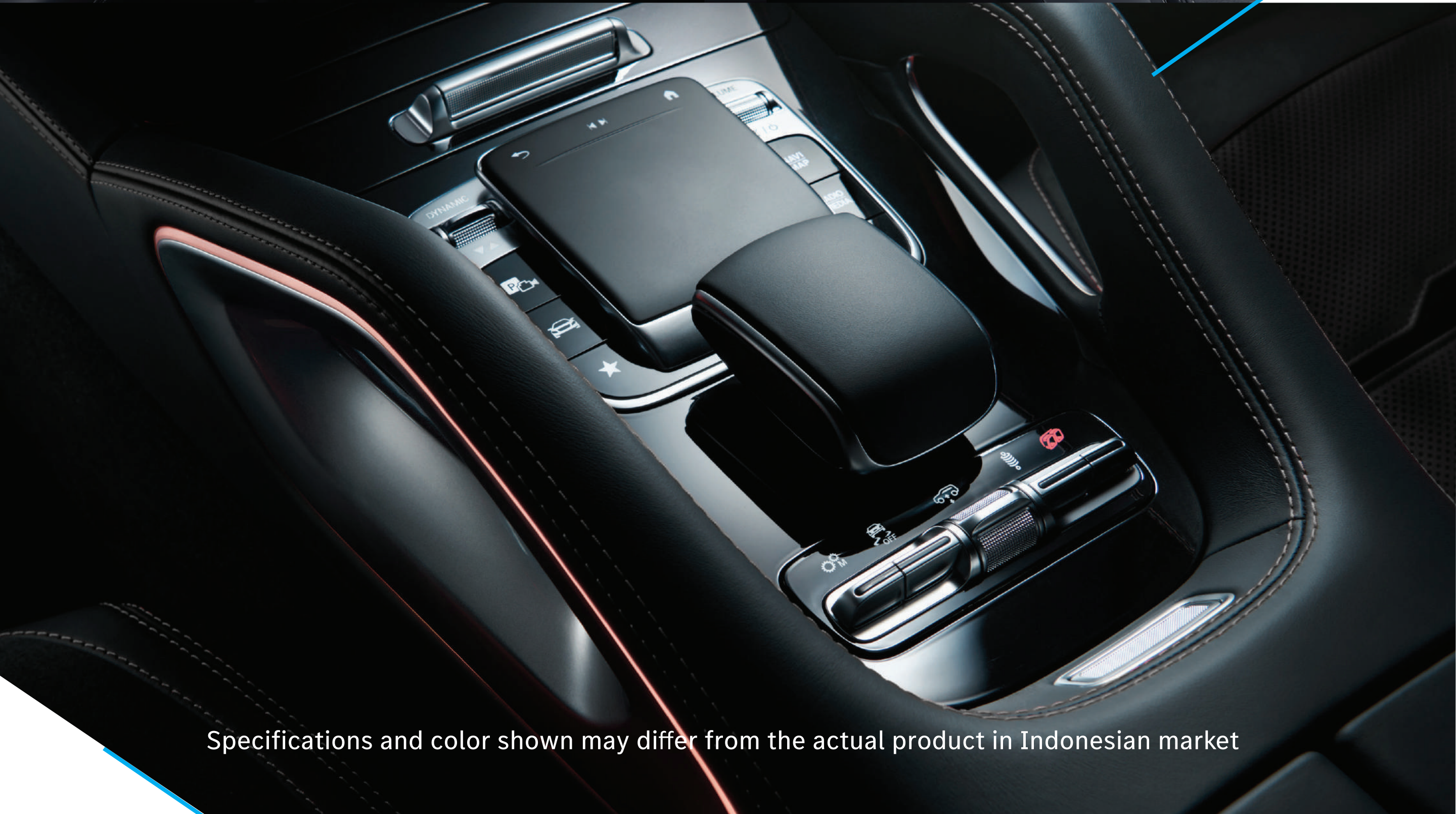
Specifications and color shown may differ from the actual product in Indonesian market