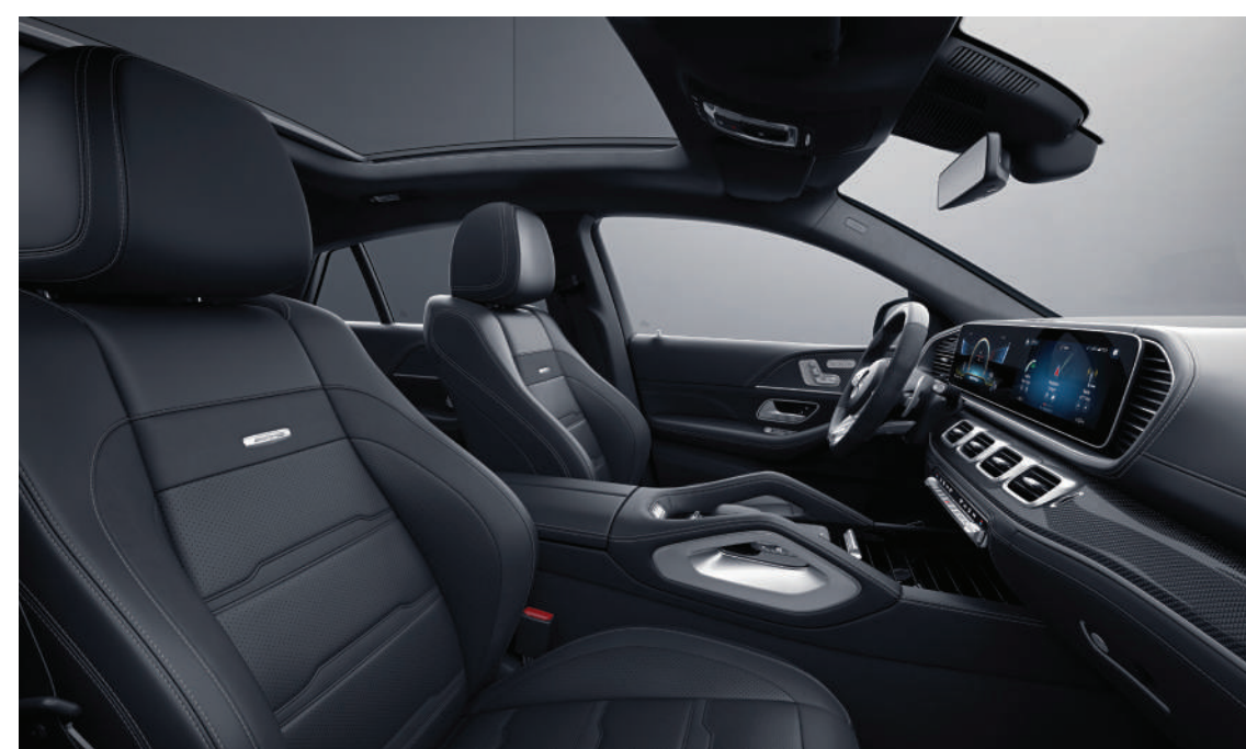
AMG nappa leather black