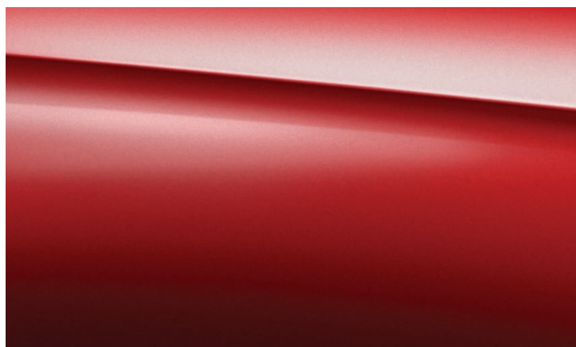
designo Hyacinth Red Metallic