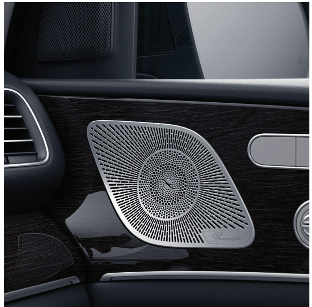
Burmester® surround sound system