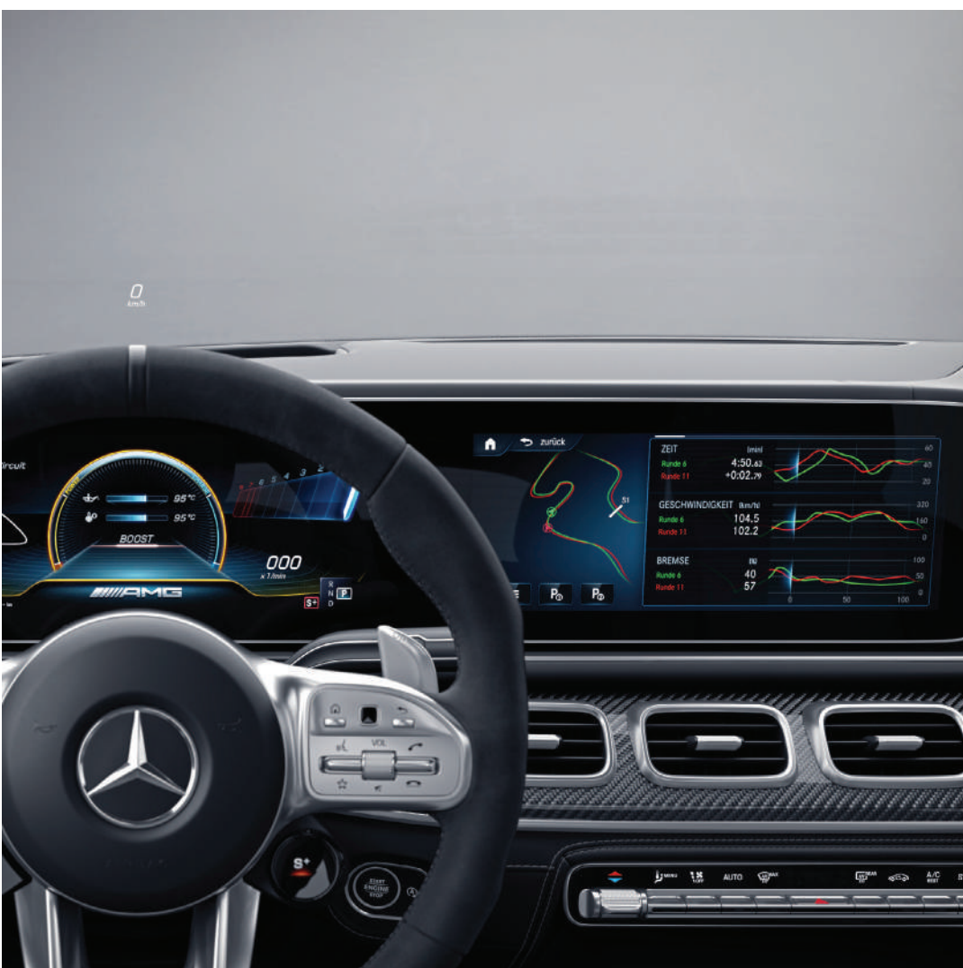
AMG Track Pace